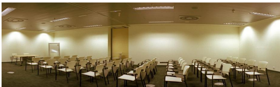
Room 3 (Capacity for 80 people)