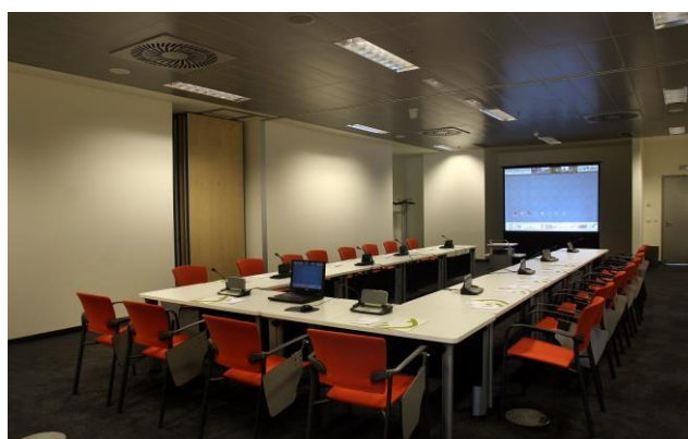
"U" Format Room (Maximum capacity for 24 people)