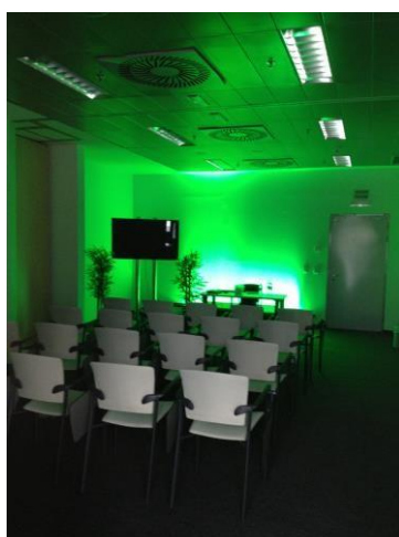
Room 5 (Maximum capacity for 30 people)